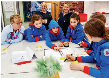
Commissioners and Guides learn about cells