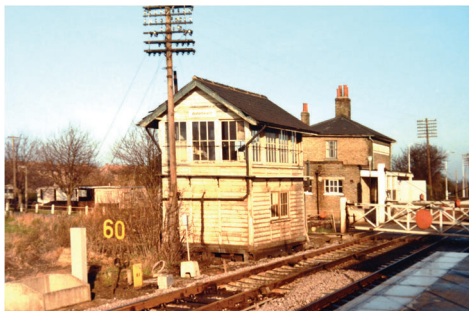
Waterbeach Station - approx. 1980

The opening ceremony was on the 28th (a Tuesday), and was a very lavish